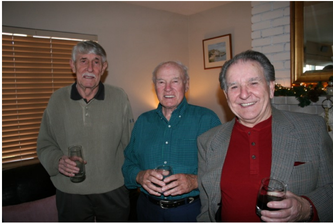
Three wise men!