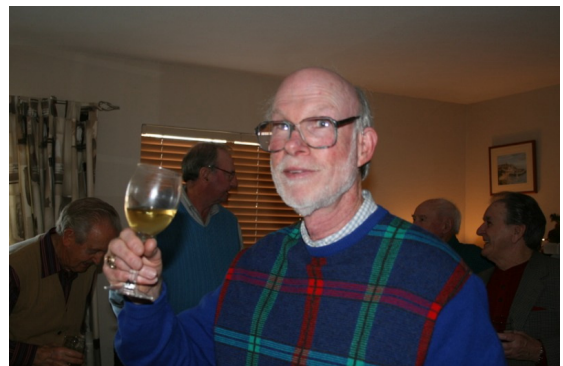
Oor Chaplain in Good Spirits!