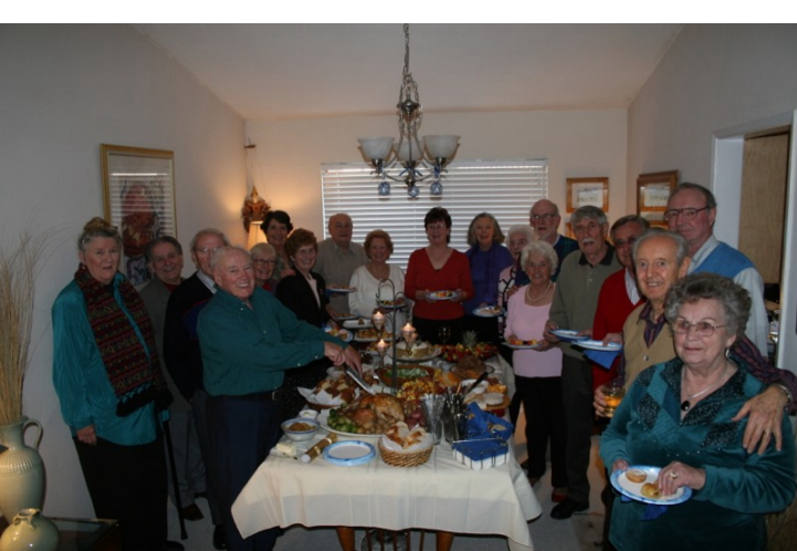
Round the table waiting to get tucked in!