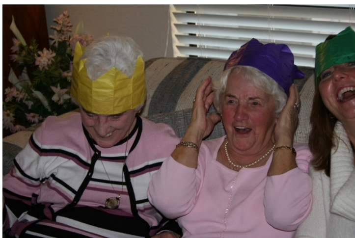
The girls having a laugh with their hats